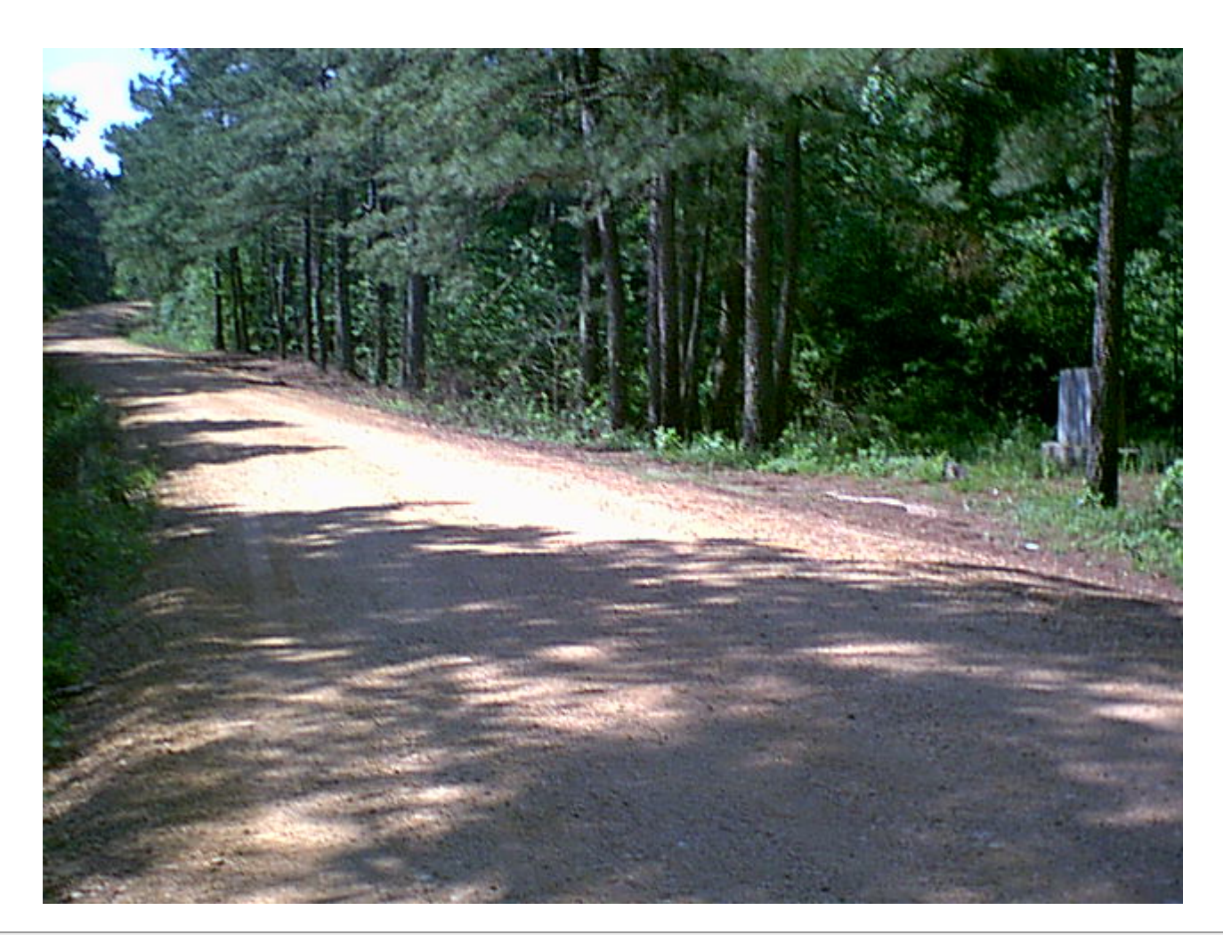
Photos and transcription by <u>Charlotte Curlee Ramsey</u> May 25, 2003 This Monument is enclosed between locked gates now, in the Belfast Hunting Club area off of Hwy. 35, near Tull, AR.